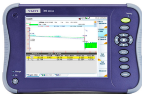
Compact multilayer platform for network installation and maintenance