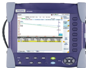
Scalable platform for multilayer and multiple-protocol testing